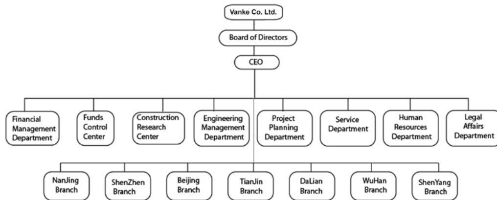
Figure 1a: Vanke Organizational Structure (as of 2013) 10

Given its unconventional business style, Vanke's diversification into the ice and snow industry seems