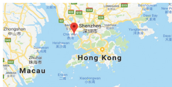
Figure 4: Shekou benefits from being near Hong Kong, China's Special Administrative Region and the traditional recipient of foreign investments.

As a state-owned enterprise, CMG has long played a critical role as front runner to the Chinese government's economic and infrastructure plans. Most famously, CMG formed CMG Shekou in 1979 with the sole purpose of supporting China's open-door economic reform. 19 Located just across the bay from Hong Kong, Shekou was China's first Industrial Zone, and was in operation well before the more well-known Shenzhen Special Economic Zone.