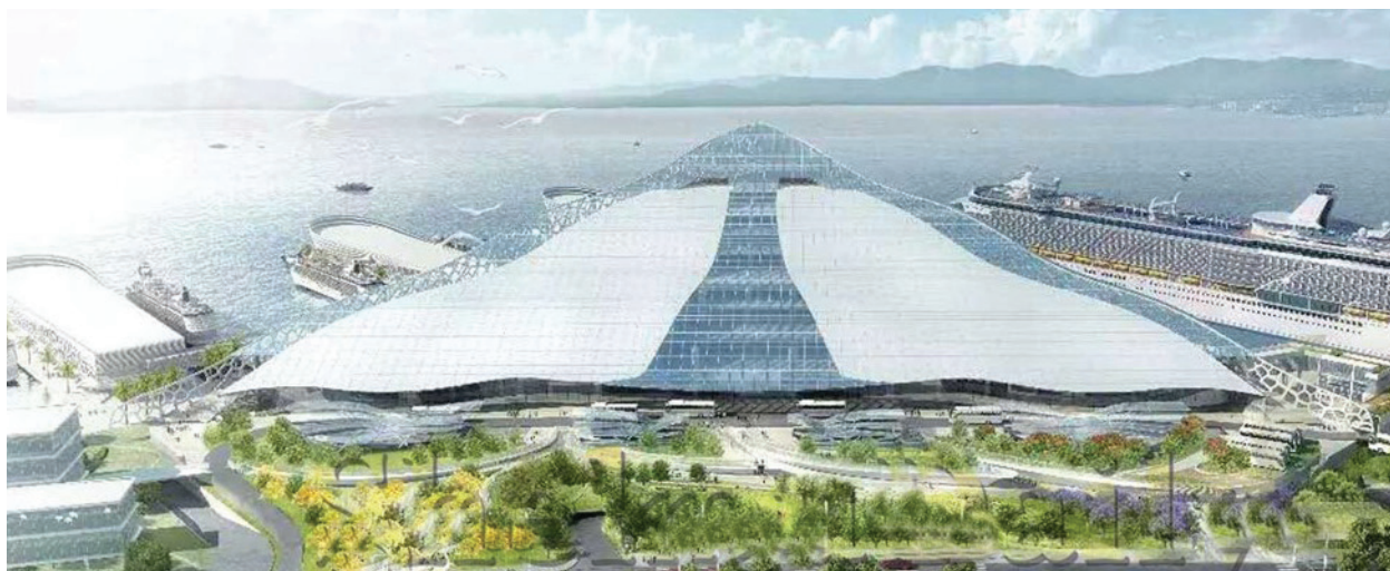
Figure 3: The Shekou Cruise Homeport, located less than 20 miles from Shenzhen International Airport and Hong Kong International Airport