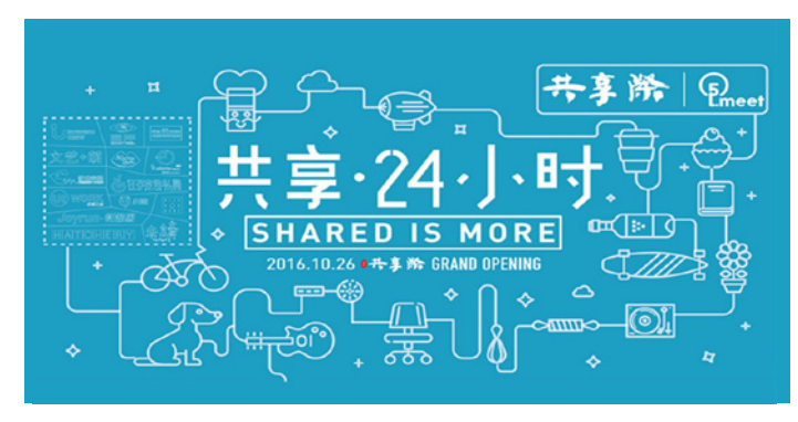
FIGURE 1: AROUND-THE-CLOCK SHARING