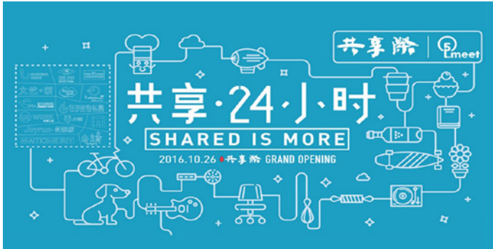
FIGURE 1: AROUND-THE-CLOCK SHARING