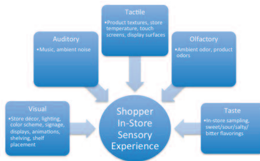
Figure 1. Inputs to the Shopper’s In-Store Sensory Experience

This customization approach suggests a balance of designer and self-essence to maximize purchase intent. Therefore, the purchase intent for luxury items with a disproportionate amount of either self- or designer essence is sub-optimal. For example, a product with high self-essence but low designer essence and a product with the opposite features should generate similarly weak purchase intent.